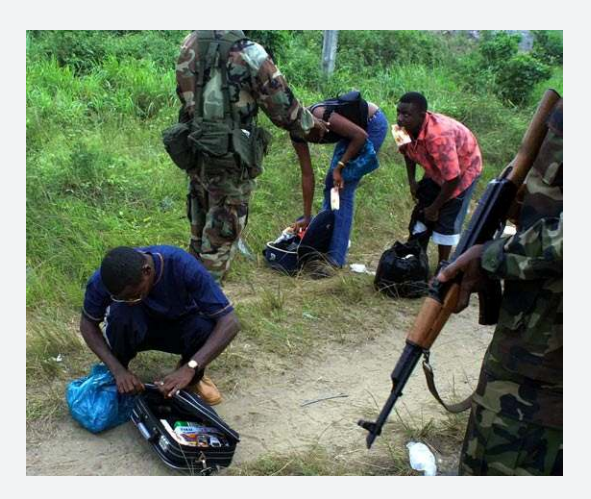
Nigerian military stop and search residents in Warri, 2003.

Ambassador Jeter's cable was sent during national elections widely marred by rigging and political violence. The local oil city of Warri had been at the epicentre of a recurrent political and ethnic conflict between the Ijaw, Urhobo and Itsekiri ethnic groups. The main source of funding for the conflict was 'oil bunkering', the tapping of crude oil from pipelines and other infrastructure for sale on the black market.<sup>6</sup> Ethnic militia fought each other and government forces to control the highly profitable trade in stolen oil.