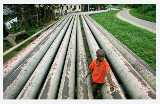
A boy stands between pipelines in Okrika, Rivers State.

While professional training and sustainable employment are sorely needed in the Niger Delta, Shell's security contracts have provided neither. These contracts have fuelled violent rivalry between armed youth groups, de-stabilised communities and sparked communal conflicts.<sup>47</sup> Shell and other companies have