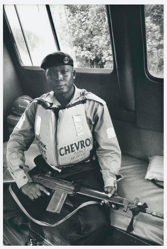
Nigerian Joint Task Force soldier guarding Chevron facilities in the Niger Delta.